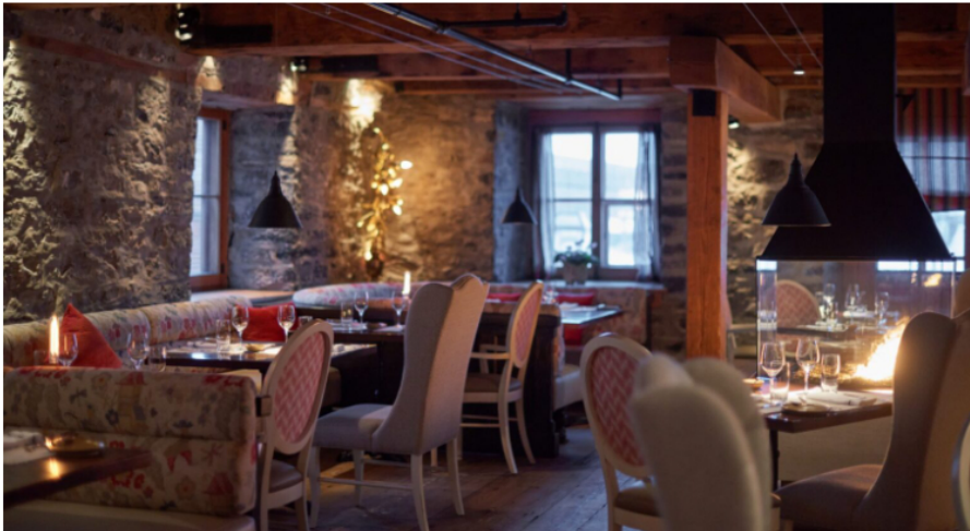
Chez Muffy restaurant.

Although a contemporary Relais & Châteaux property, the Auberge Saint-Antoine is actually housed in an original building that dates back to 1687.