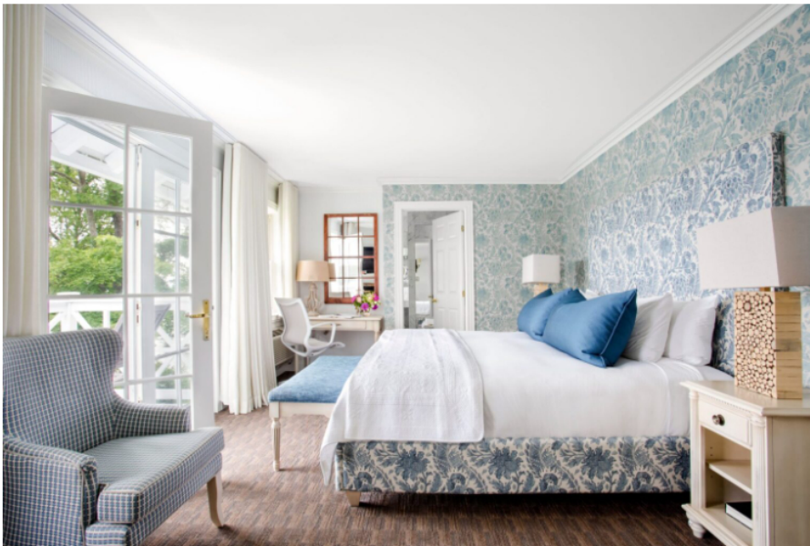
The Cartier Suite at Manoir Hovey.

A three-floor spa is also set to open this winter complete with an infinity pool.