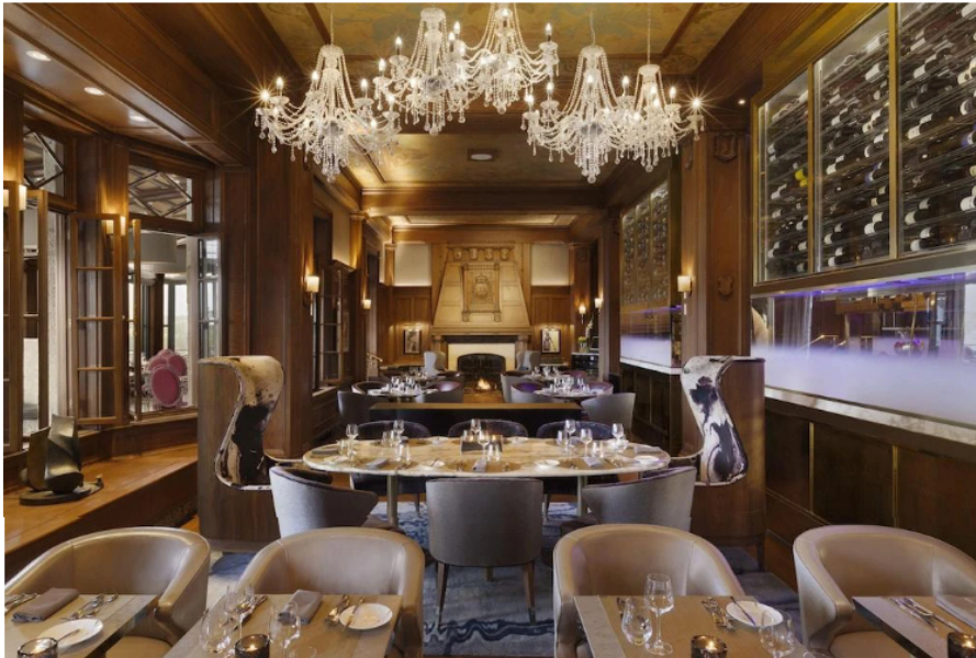
Inside the historic hotel.

The heritage Fairmont Le Château Frontenac is known to be one of the most photographed hotels on the globe — and for good reason.