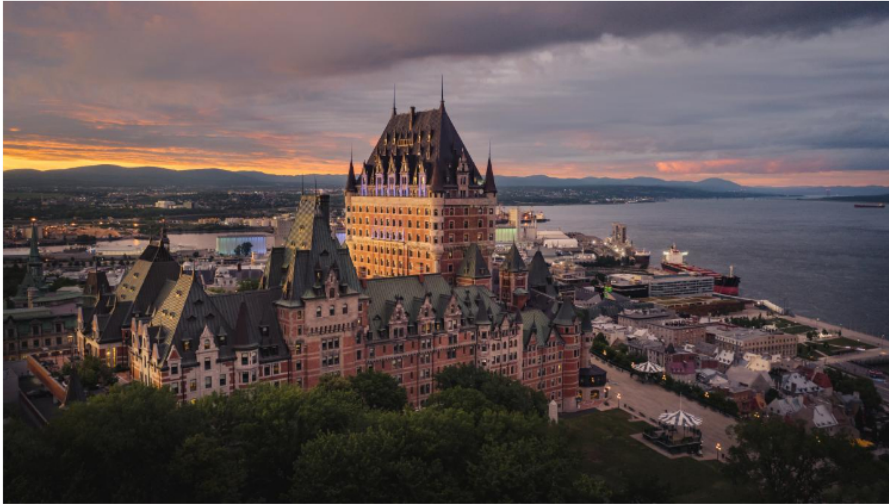
The Fairmont Le Château Frontenac.

The heritage Fairmont Le Château Frontenac is known to be one of the most photographed hotels on the globe — and for good reason.