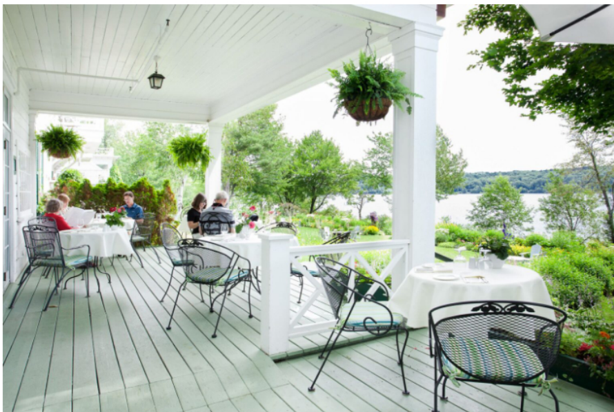
An outdoor dining area on the property.

The five-star Relais & Châteaux estate draws from southern inspiration for its 36 spacious rooms, which are in both the main manor and in exterior cottages (including a secluded three-bedroom chalet).