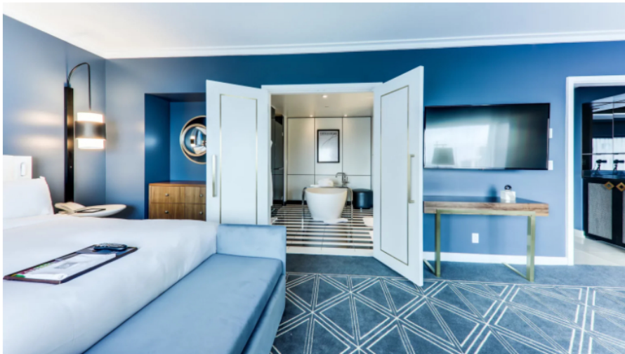
A suite inside the Fairmont Queen Elizabeth.

A luxe and spacious lobby hosts the trendy and bustling coffee shop Crema, which is among the best lattes in town.