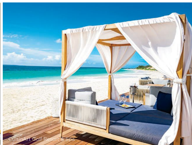
CuisinArt Golf Resort &amp; Spa