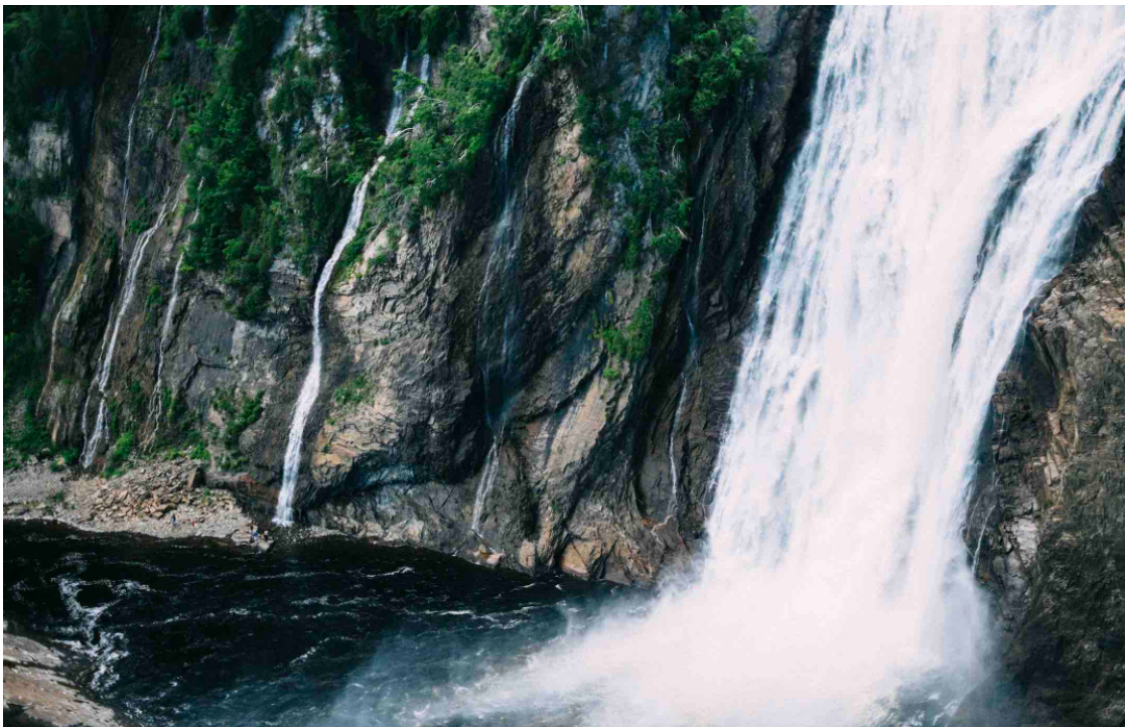
A visit to Chute-Montmorency should feature highly on your list if things to do in Old Quebec City

Rent a bike from www.cycloservices.net to navigate the paved cycle paths that lead out of the city to the Parc de la Chute-Montmorency . Once you arrive at the park, you can take a cable car up the mountain to take in the awe-inspiring views of Montmorency Falls .