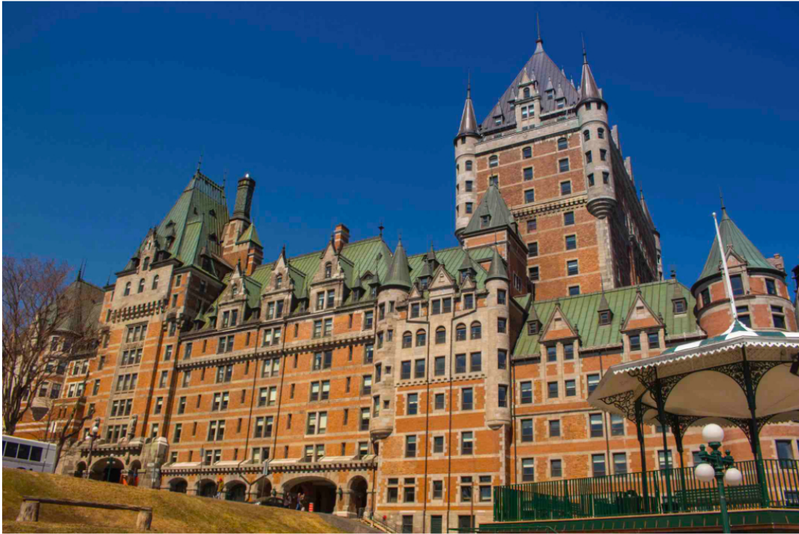
The Fairmont Le Château Frontenac makes for the perfect base from which to explore Old Quebec City

While it is one thing to visit this historic site, it is even grander to be able to stay within these historical walls as a guest. Holding sway above the city is the regal 128-year-old Fairmont Le Château , the most photographed hotel in the world, and one of the top places to stay in Quebec City .