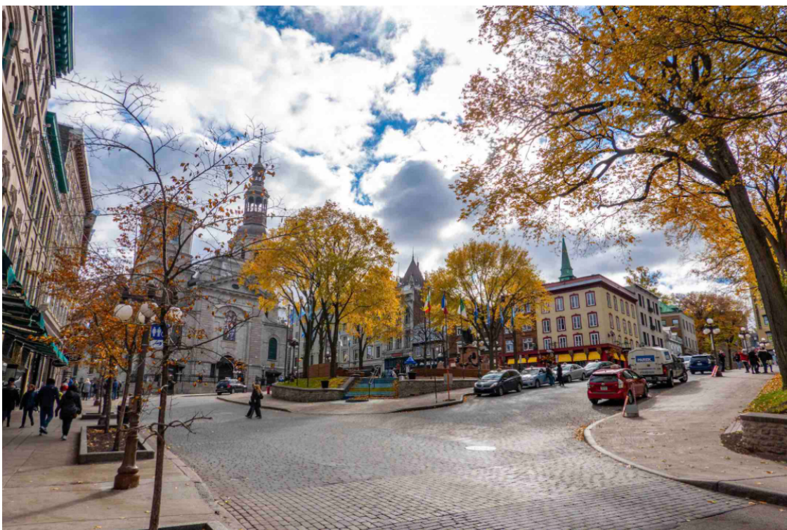
A walking tour of Old Quebec City is always full of surprises

You can easily spend a whole afternoon blissfully lost in the old city's warren of lanes, meandering through evocative alleys, ducking into eclectic galleries, and enchanting shops, and wandering past mouth-watering bistros, brasseries and boulangeries. History is everywhere, from endless statues and plaques to the great museums and sites like Battlefields Park and the Citadel .