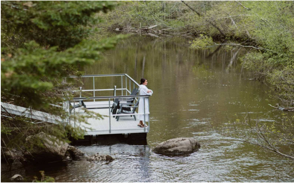
Enjoy a relaxing few hours at a riverside relaxation station at Siberia Station Spa

Relax at the Siberia Station Spa located just on the outskirts of the city, with its hot and cold pools, waterfalls, steam baths and saunas, and some amazing riverside relaxation stations.