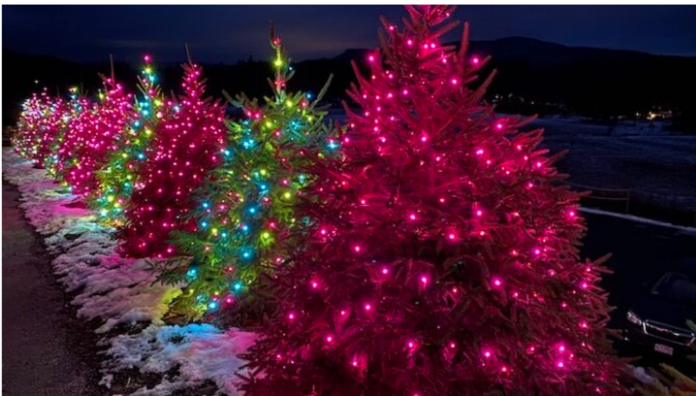
Christmas, Photo: Meryl Pearlstein

🕒 December 20, 2021 👤 Meryl Pearlstein 📁 Worldwide Attractions 💬 0