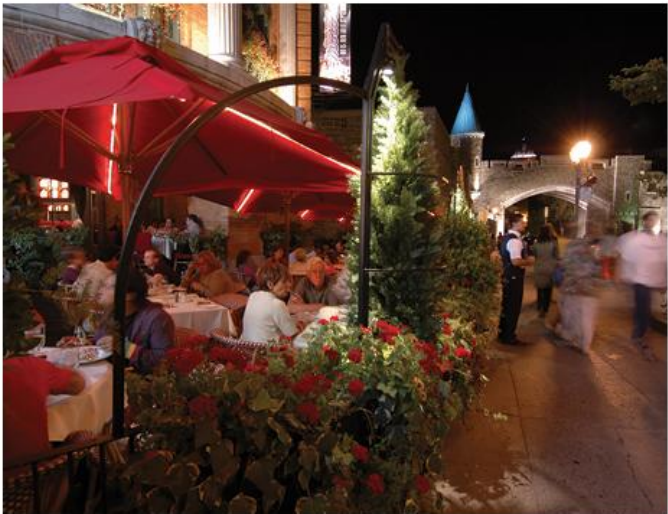
Night life, Québec City

products and flavours meet international inspirations, on a menu that pays tribute to the richness and beauty of the products of our land.