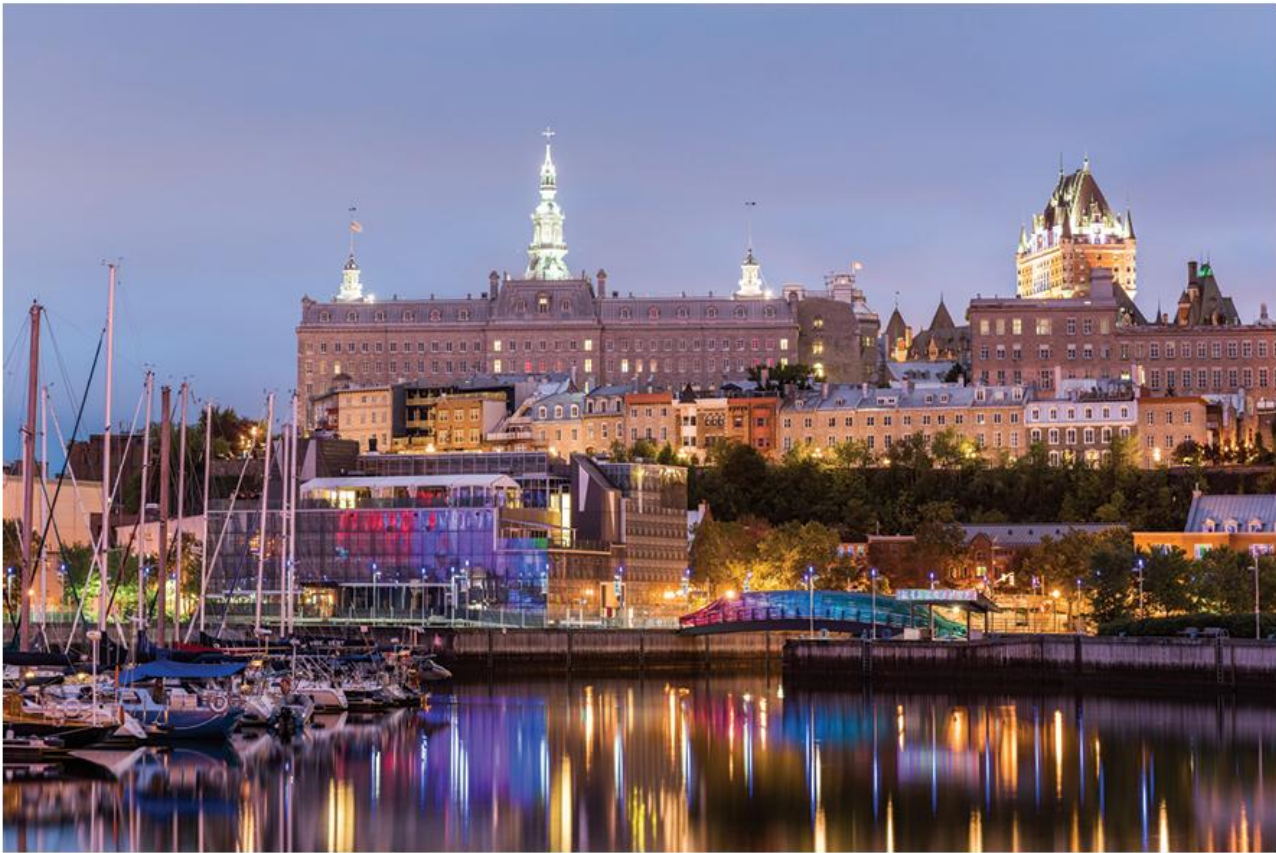
Québec City's Old Port