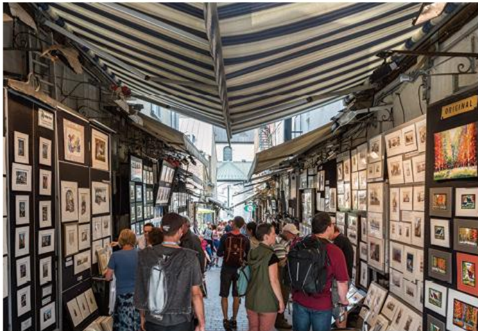
Rue du Trésor