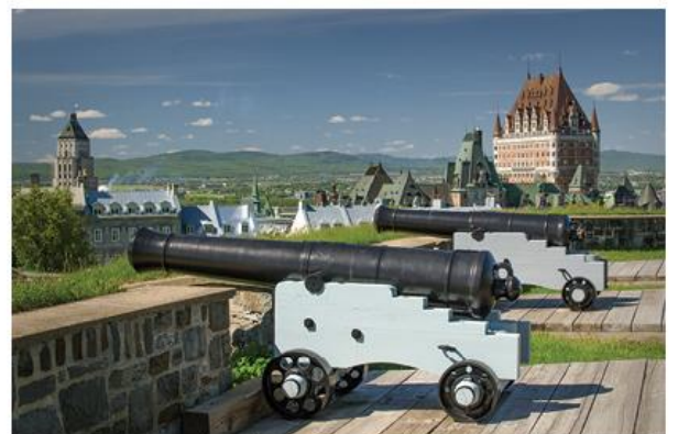
Citadelle de Québec