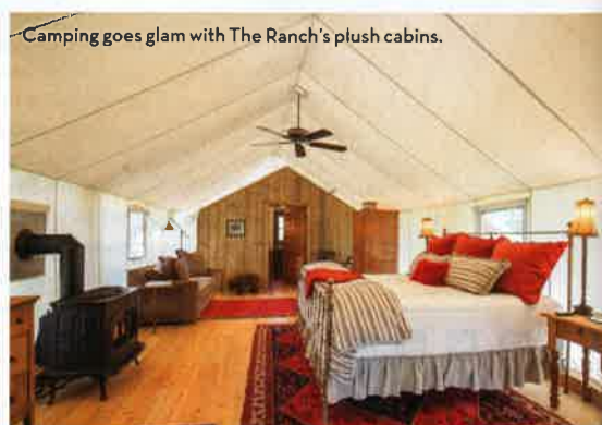
Camping goes glam with The Ranch's plush cabins.

Tucked into elegant Western accommodations next to a roaring fire surrounded by rolling hills and distant snow-capped mountain peaks, Montana's appeal is undeniable and for a peaceful rest after months of wedding planning, there's simply no better escape.—J.O.