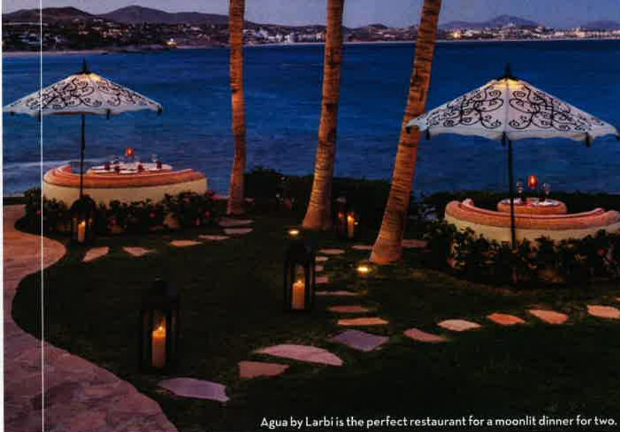
Agua by Larbi is the perfect restaurant for a moonlit dinner for two.

Colombia, Mexico, Montana, St. Maarten and Quebec City are five amazing places we love for your honeymoon getaway!