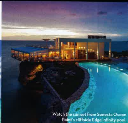
Watch the sun set from Sonesta Ocean Point's cliffside Edge infinity pool.