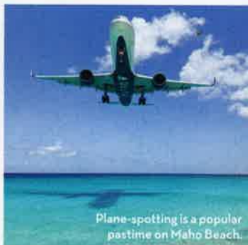
Plane-spotting is a popular pastime on Maho Beach.