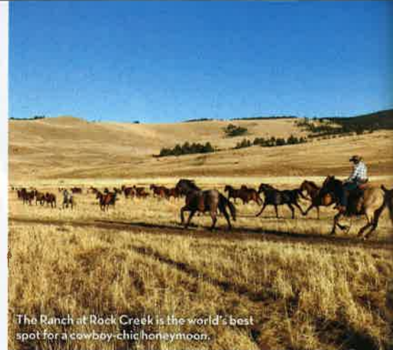
The Ranch at Rock Creek is the world's best spot for a cowboy-chic honeymoon.