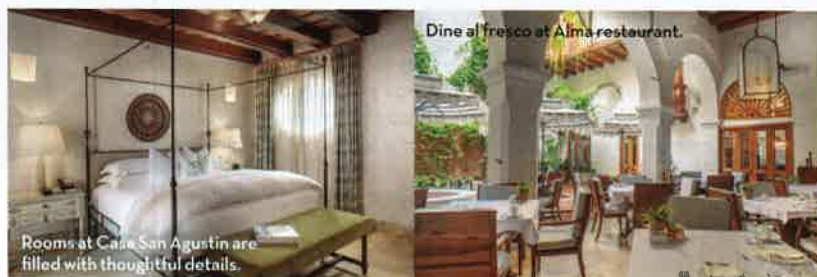
Rooms at Casa San Agustin are filled with thoughtful details.

To experience Cartagena to the fullest, book a stay at an exclusive boutique hotel; there's nowhere more honeymoon-appropriate than Casa San Agustin. Step through the property's ornate gates and you'll discover a tranquil escape where history meets modernity. With just 20 guest rooms and 11 suites spread across three exquisitely restored 17th-century colonial homes, Casa San Agustin has the intimacy of a luxurious family home with all the thoughtful amenities of a five-star hotel. A palm-fringed courtyard frames a pool set against an ancient aqueduct, while original frescoes adorn the walls. At the heart of the property sits Alma, a modern Colombian restaurant with world-class fare and live music, which is rated among the best places to dine in Cartagena. This hotel is a true refection of the city, highlighting the area's rich past and exciting future as one of the most fashionable destinations in South America.—Jen O'Brien