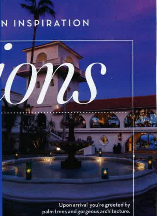
Upon arrival, you're greeted by palm trees and gorgeous architecture.