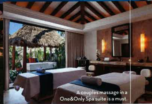
A couples massage in a One&Only Spa suite is a must.