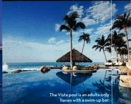
The Vista pool is an adults-only haven with a swim-up bar.